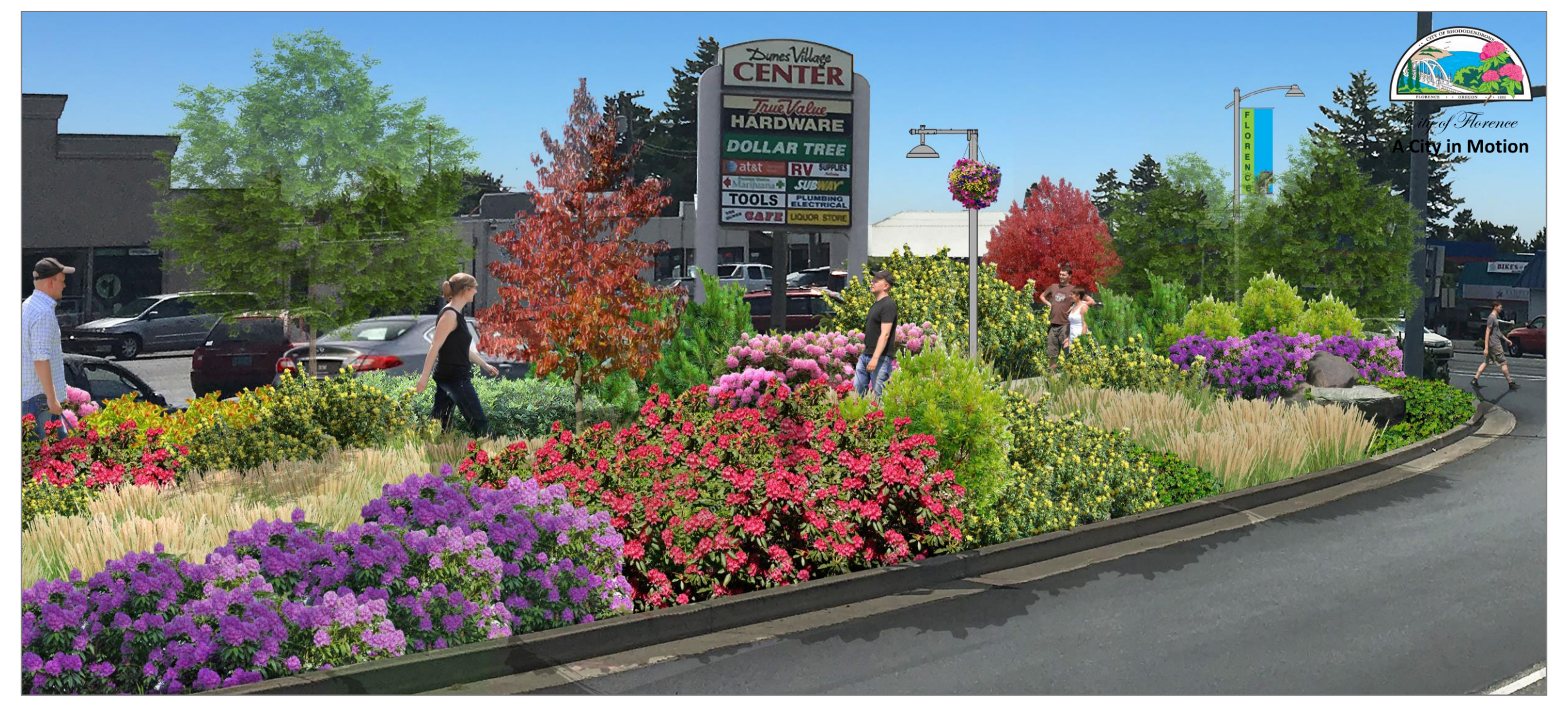
Hwy 101 & 126 Intersection