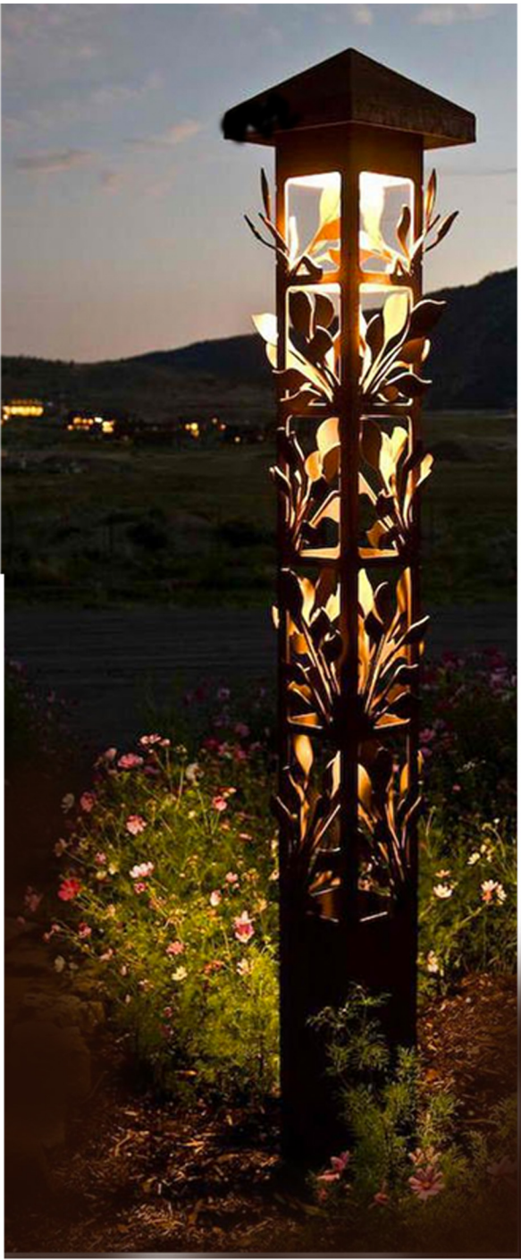
TOWER LIGHT EXAMPLE: Plasma Cut and welded steel Deco design to be determined