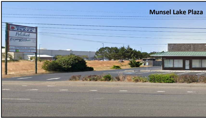
Munsel Lake Plaza