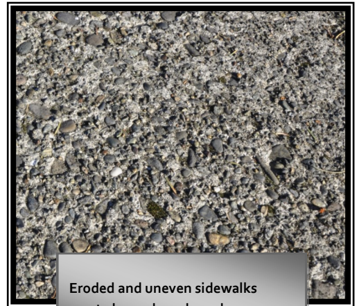
Eroded and uneven sidewalks create hazards and are dangerous.