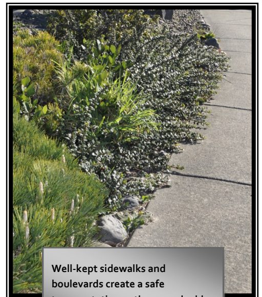
Well-kept sidewalks and boulevards create a safe transportation pathway and add to the City's curb appeal.