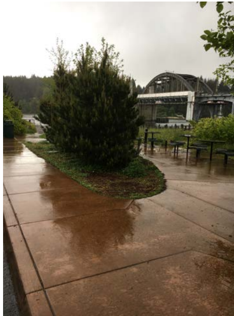
#1. #1294021, "Transformation"