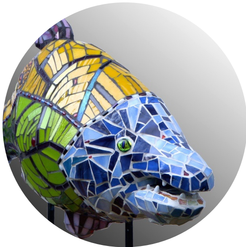
Glam-y Salmon Mark Brody Mosaic Work Height: 26in on Metal Posts Widest Points are 12 x 44in Price: $3,800