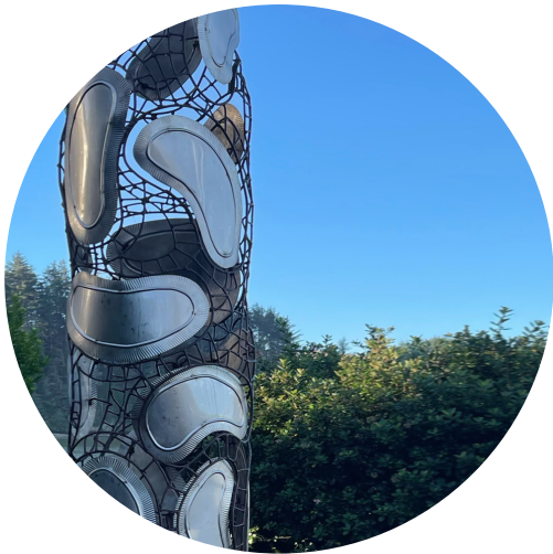
Pier 56 Rodger Squirrell Stainless Steel Height: 66in Widest Point is 22in Price: $28,700