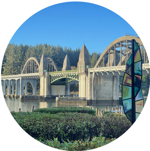
Pluma Sculptura, aka The Feather Kirk Seese Mosaic Work Height: 10ft Widest Point is 22in Price: $7,500