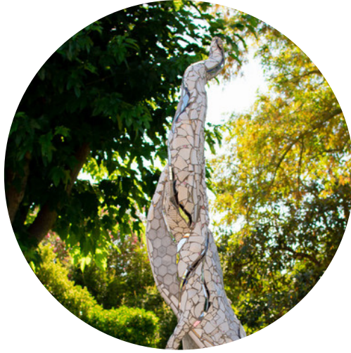
goddess Lucy Ruth Wright Rivers Recycled Materials Mosaic Height: 91in Widest Point is 28in Price: $13,500

All Art is Available for Purchase - Visit ci.florence.or.us