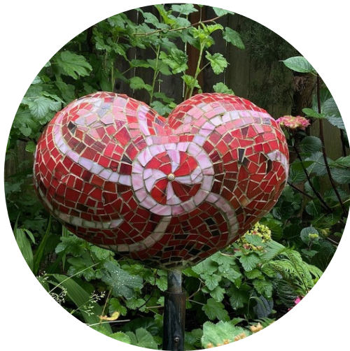
Heart in the Garden Mark Brody Mosaic Work Height: 22in on Metal Post Widest Points are 19 x 9in Price: $1,100