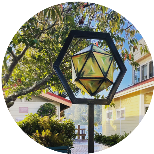
Icosahedron Kirk Seese Steel, MDF, UV Inks Height: 7ft Widest Point is 3ft Price: $7,500