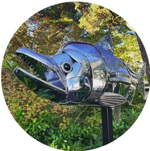
Loki - Sockeye Salmon Jud Turner Recycled Vehicle Parts Height: 66in on Metal Post Widest Points are 19 x 9in Price: $8,000