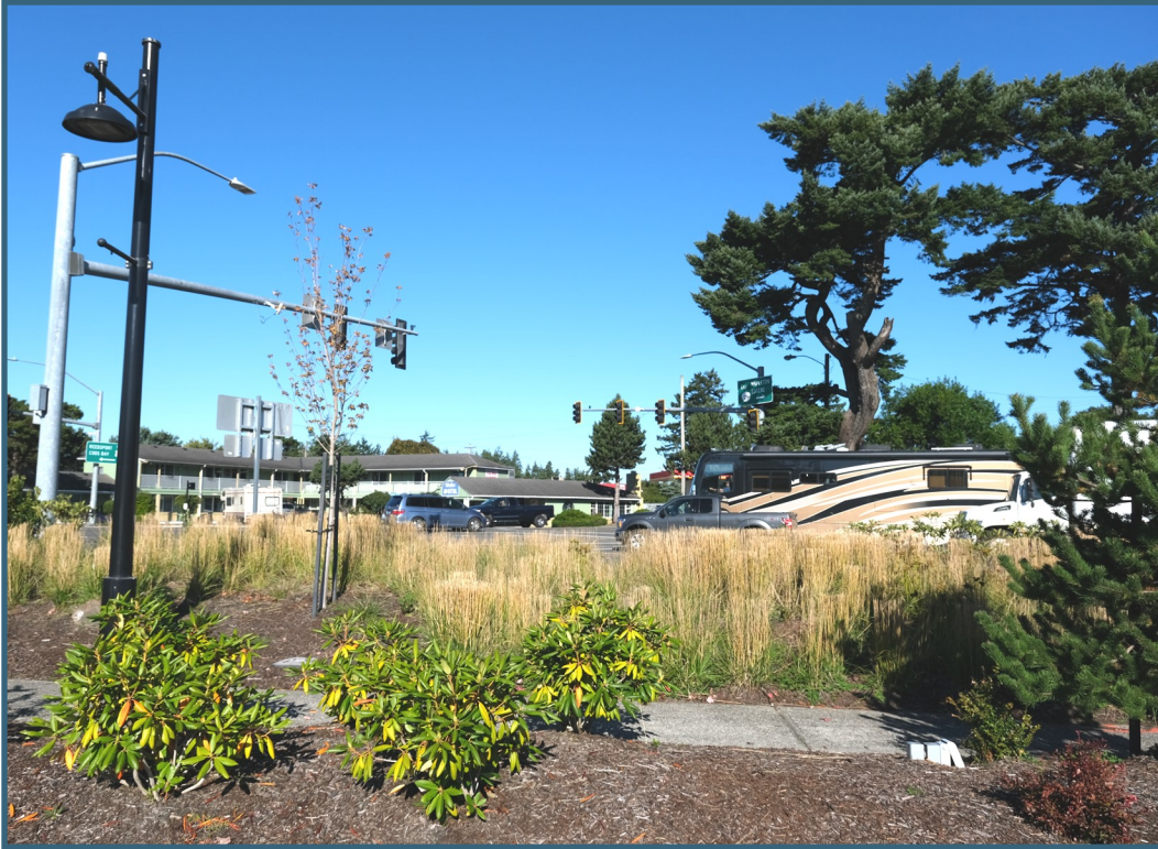
Location #1 Highway 126 Intersection