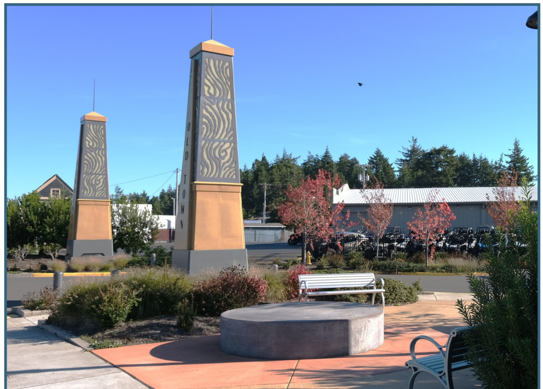
Location #4 Maple Street