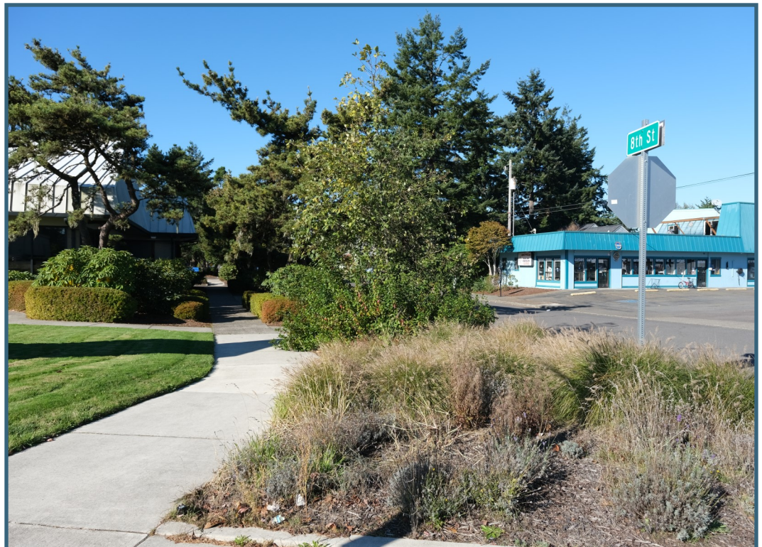
Location #2 8th Street Corner