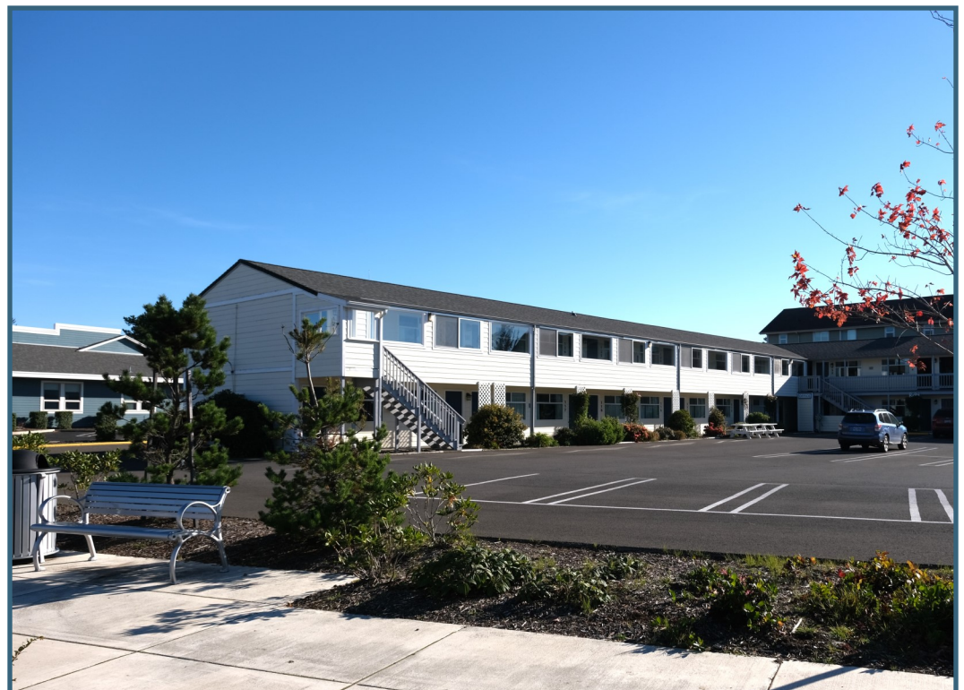
Location #6 First Street