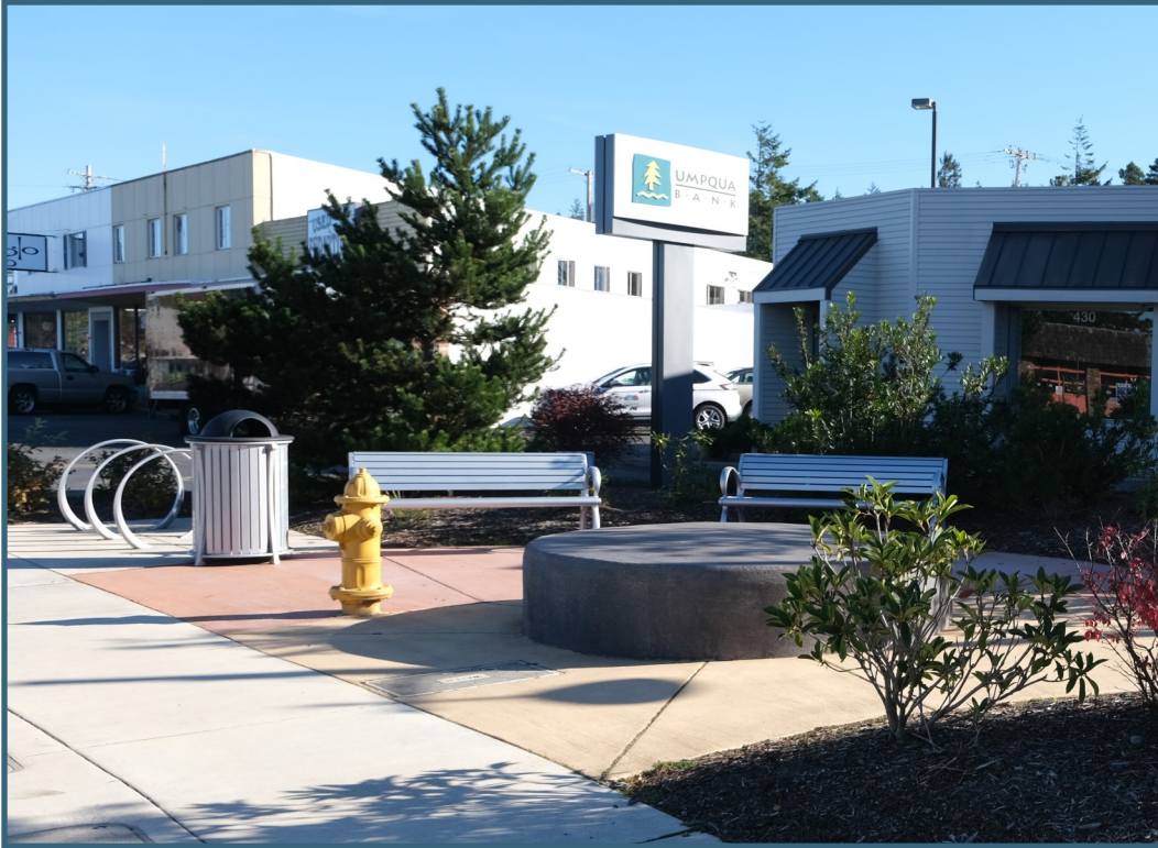
Location #3 Nopal Street