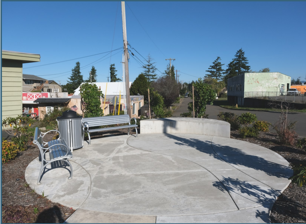
Location #5 Laurel Street