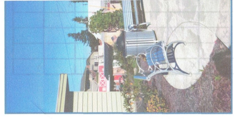
Location #5 Laurel Street

ART CITY FLORE EXPOSE ReVision Florence 2024-