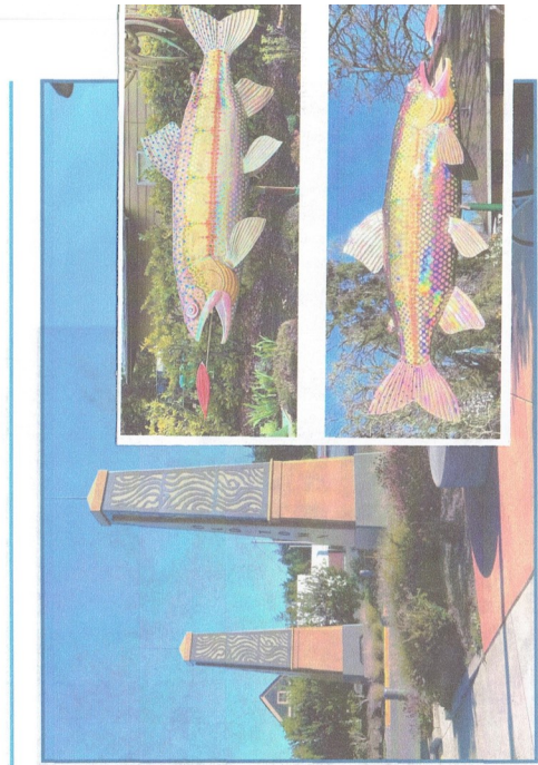
Location #4 Maple Street