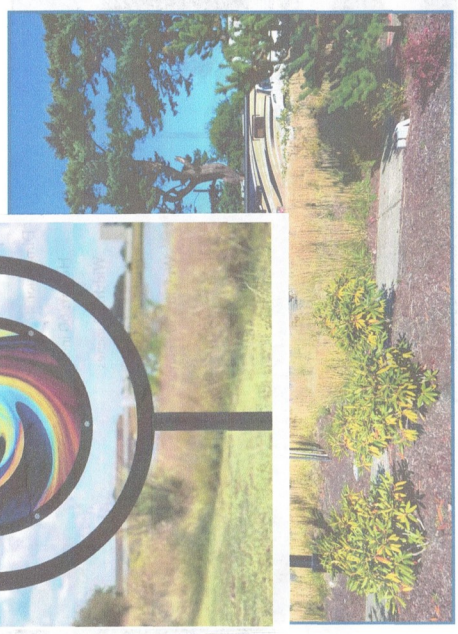
Location #1 Highway 126 Intersection