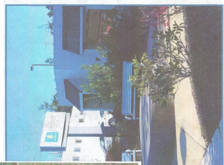
Location #3 Nopal Street