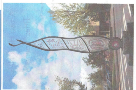
Location #2 8th Street Corner