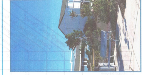
Location #6 First Street