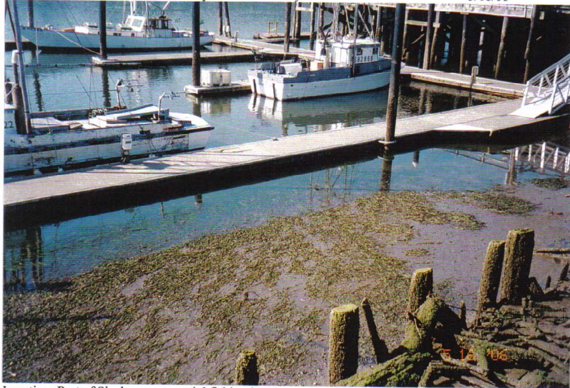
Location: Port of Siuslaw commercial fishing boat moorage. Looking SE from Boardwalk at Zostora areas shown in photos 2 & 3.