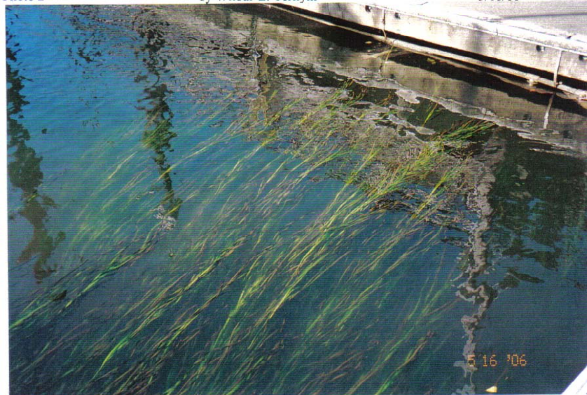
Location: Port of Siuslaw commercial fishing boat moorage. Dense stand of Zostera just out board of north walkway.