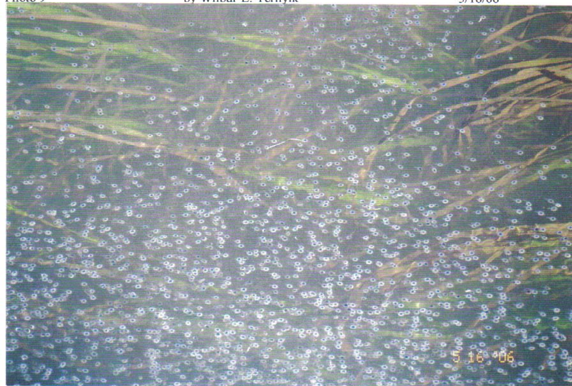
Location: Port of Siuslaw Boardwalk float area. Zostora and juvenile ?