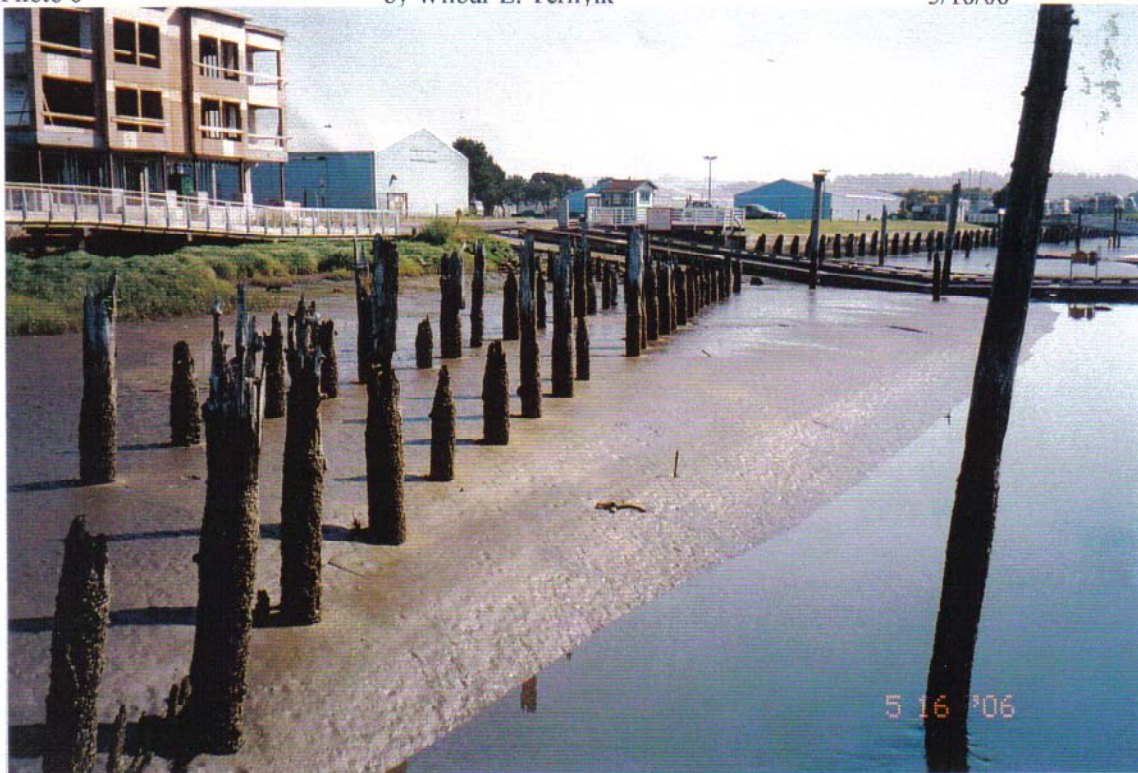
Location: Looking over mud flats just east of Port of Siuslaw property. Similar conditions but no Zostora.