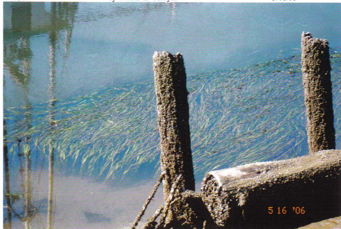
Location: Port of Siuslaw commercial fishing boat moorage. Looking north from same walkway. Zostera stand just up river.