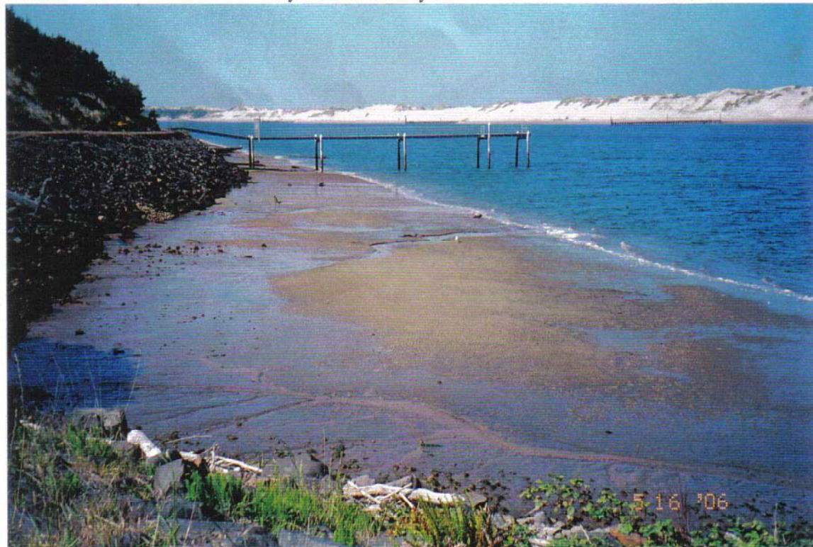
Location: Lower Siuslaw estuary near Wild Winds Subdivision site. Right elevation and salinity but no Zostora .