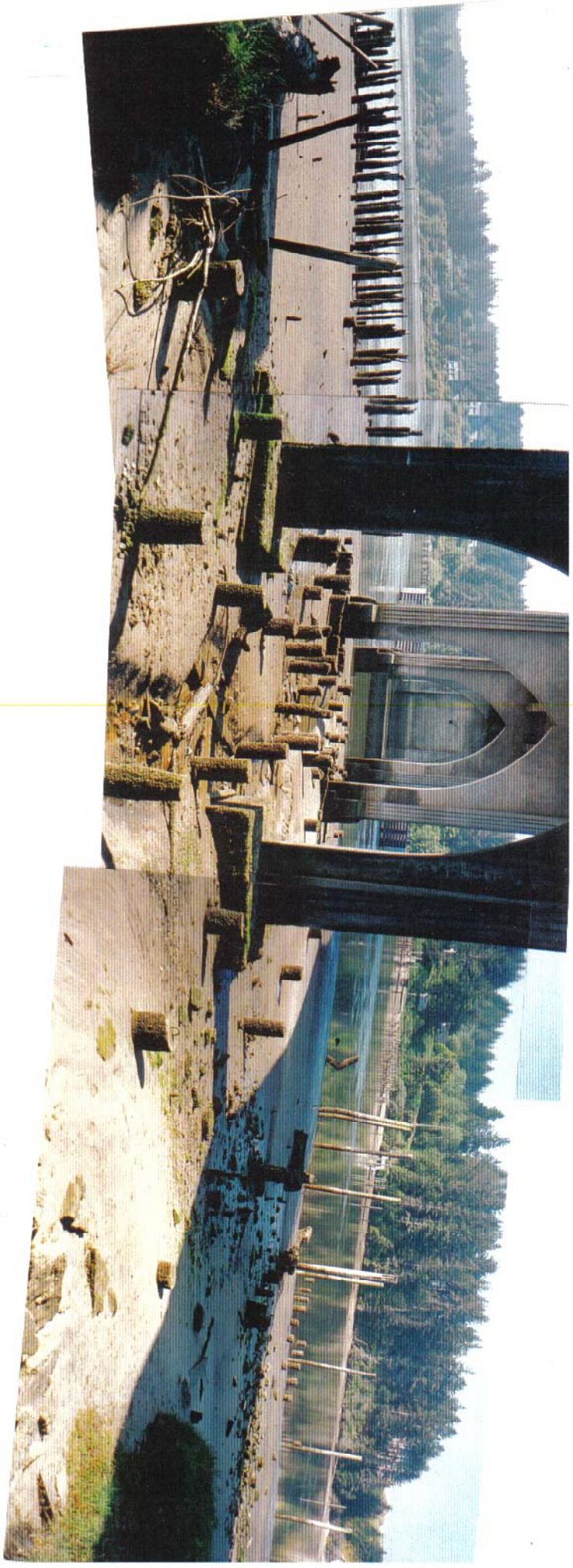
Location: North side of Highway 101 Bridge; looking south to under side of bridge. Note zero evidence of Zostera above and below the bridge.