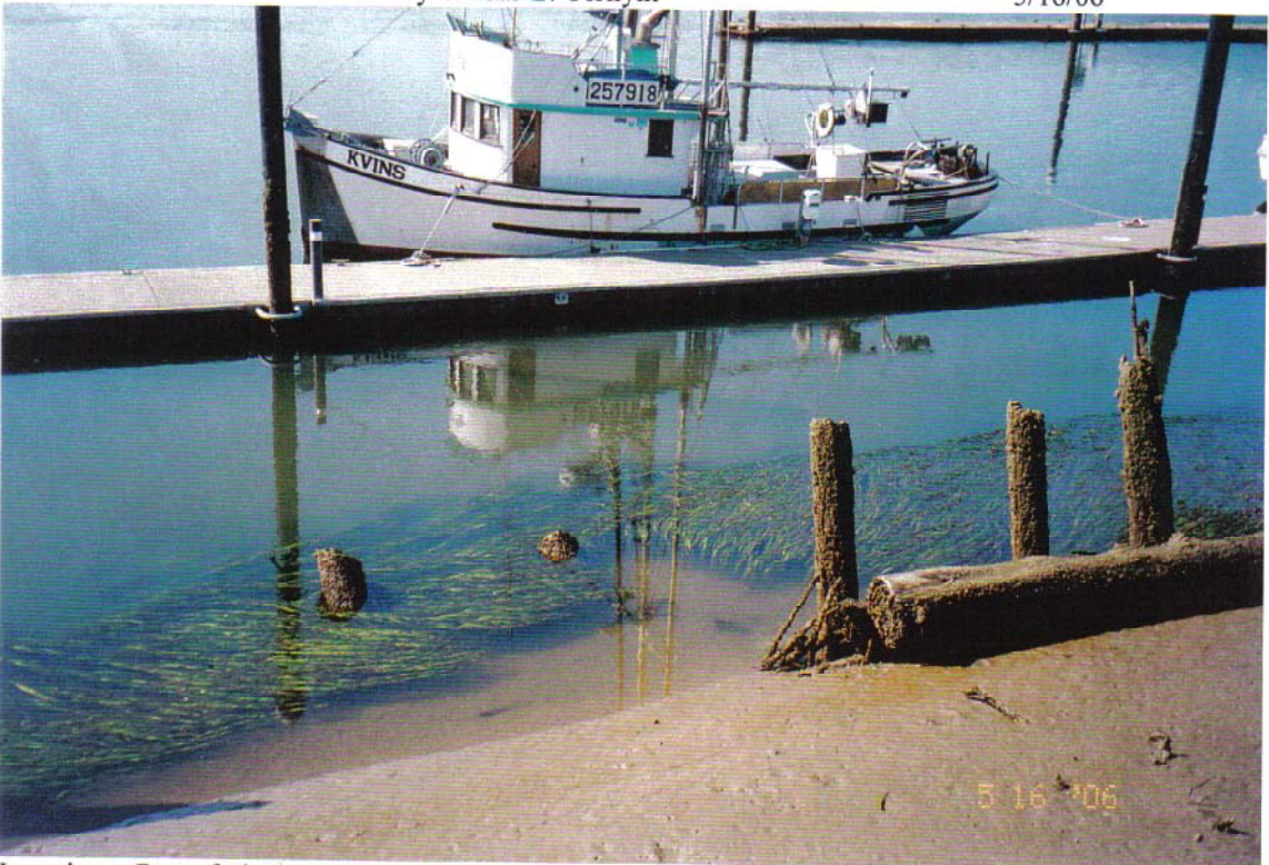
Location: Port of Siuslaw commercial fishing boat moorage. Same as photo 4 only further upstream. More Zostora beds growing in still water conditions.