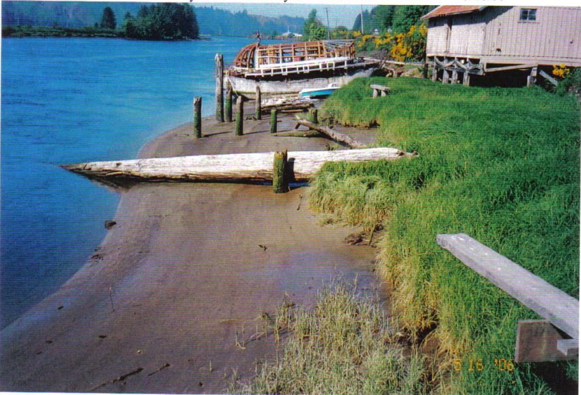
Location: Cushman Store looking downstream. Former Zostora beds now gone .