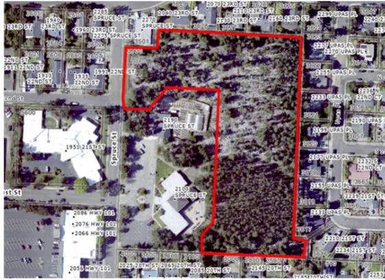
Subject Property RLID 2024

The site is located on and accessed from the east side of Spruce Street, north of 20 nd Street, and south of 23 rd Street, and is in the central portion of the City of Florence. It is comprised of one tax lot (Map 18-12-23-34, Tax Lot 03700) and is approximately 5.5 acres in size. The site abuts the church land to the west, residential to the north, south, and east; there is no applicable overlay zone.