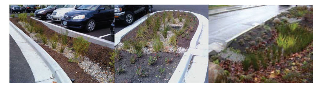
See Appendix I SW-120 for typical private property swale detail and Appendix I SW-300-302 for typical Green Street swale details.

Description: Swales are long and narrow landscaped depressions used to collect and convey stormwater runoff, allowing pollutants to settle and filter out as the water flows from one bay to the next through the facility. Swales should be integrated into the overall site design and can be used to help fulfill a site's required landscaping area requirement.