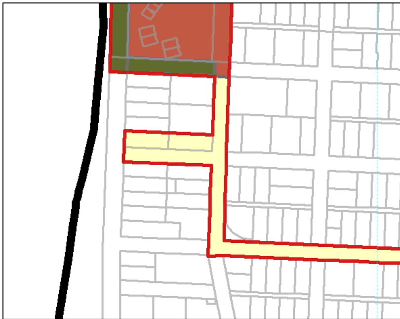
Proposed – Single-Family Residential