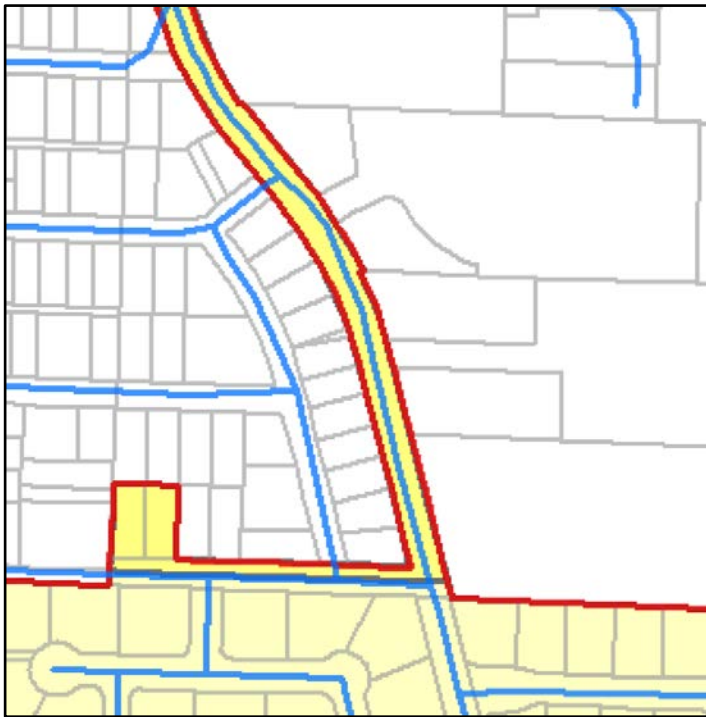
Current - None