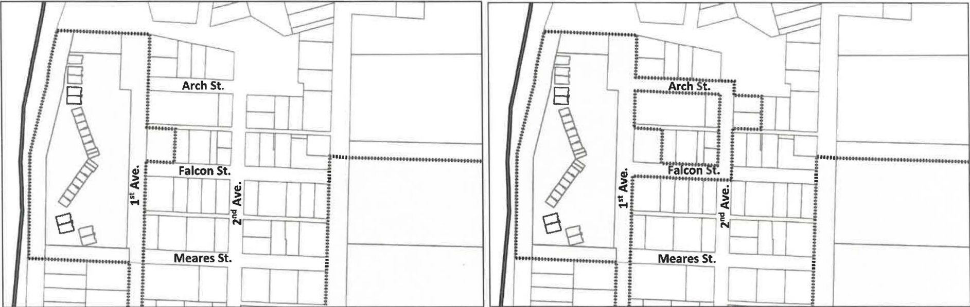
After Proposed Annexation