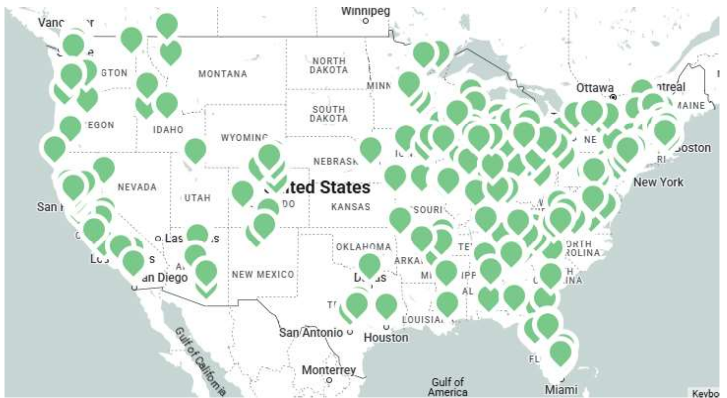
Location of Climate Mayors in the United States

https://www.climatemayors.org/member-cities