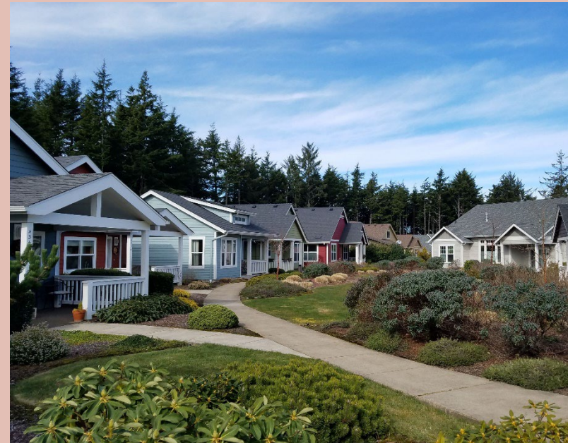
COTTAGE CLUSTER, NEWPORT