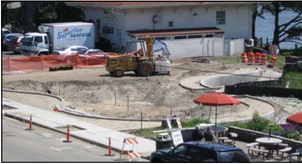
Tom Ayres General Contractor continues construction on the Siuslaw Interpretive Center.

Work continues on the Siuslaw Interpretive Center with subcontracting crews for Tom Ayres General Contractor preparing to pour the new colored concrete sidewalk for a portion of the project on Thursday, May 2 nd . This portion of the colored sidewalk starts at the west side of the stormwater quality facility and continues counter clockwise to the foot bridge location. The remaining colored sidewalks will be poured after the observation platform and foot bridge framing has been completed. Both the observation