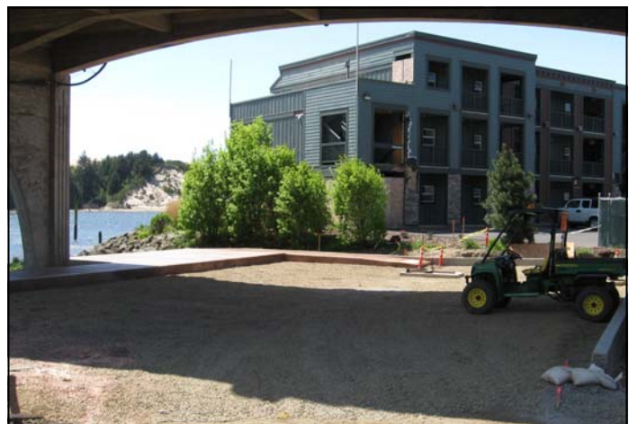
A parking area under the bridge will offer eight additional parking spots while not interfering with the “Cathedral Arches” popular with photographers.

In conjunction with the Center, a small parking area is also being constructed underneath the bridge. Colored concrete has already been poured, along with the installation of two vintage-style lights. These eight additional parking spots will provide some much-needed extra parking in the Old Town area, while not interfering with the popular “Cathedral Arch” view of underneath the Siuslaw Bridge that is so popular with photographers and artists.