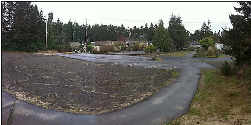
The Florence Community Garden will be located at the site of the old senior center on Airport Road.

Food insecurity is a big issue facing many rural communities in Oregon. According to the surveys conducted in Florence and the surrounding area in the Rural Lane County Community Food Assessment in 2012, 33.87% of individuals in the area have an income that is at or less than 185% of the federal poverty line and qualify for emergency food boxes. From 2011-2012, 4,022 area residents accessed an emergency food box. Furthermore, when asked what factors affected their ability