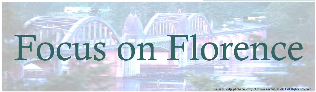
Suslaw Bridge