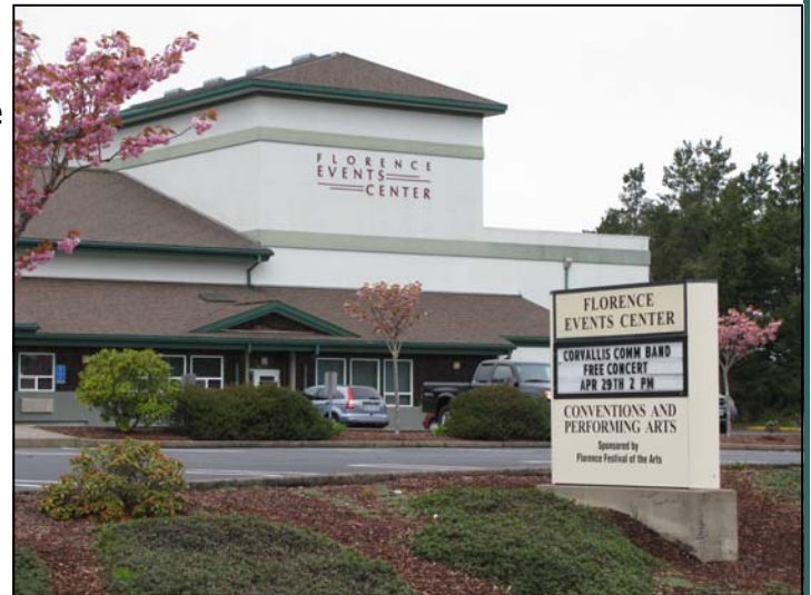
Finding permanent funding for the Florence Events Center was identified as the City Council's top goal for 2013.

After careful deliberation, seven goals were established by the Council, with finding permanent funding for the Florence Events Center as their top goal for 2013.