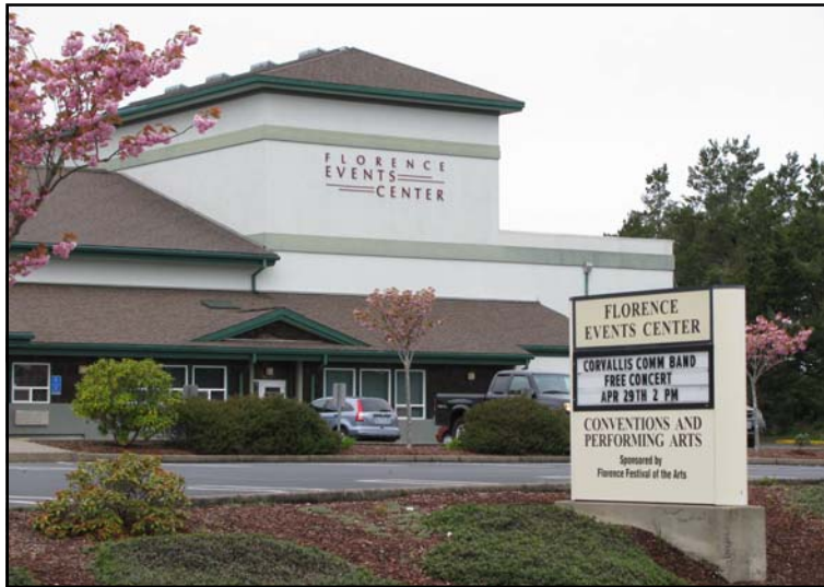
An advisory committee will be formed to research funding options for the Florence Events Center.

cuss future operations (which, thank goodness for the staff, we have a plethora of volunteers that get things done), and asses the value of what this facility brings to the community. Do we want to ask citizens if they want to use general fund money? Would there be support for a