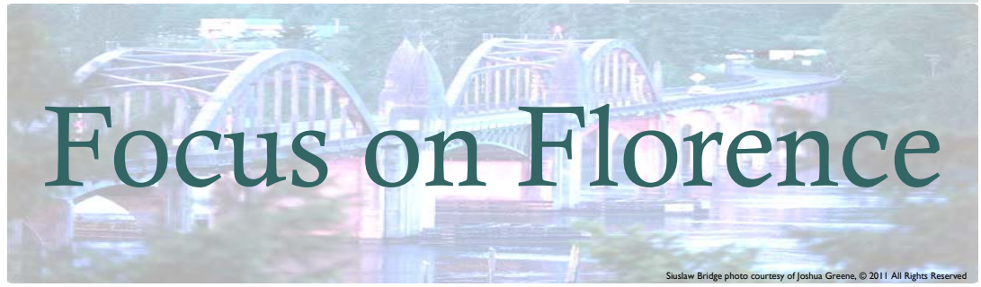
Siuslaw Bridge