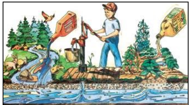
Stormwater, surface water, groundwater — it’s all connected. Protecting one protects the others.

The City is now performing the final tasks required to close-out the grant and ensure compliance with all EPA administrative conditions. Successful completion of this large, multi-faceted project places the City in a favorable position to receive future federal grants and the partnerships developed through this project will help facilitate positive working relationships with our federal, state, tribal, and local partners for years to come.