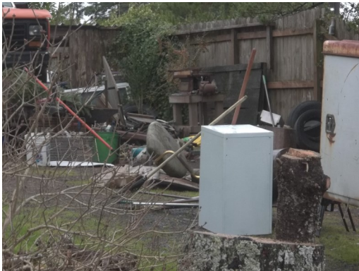
Garbage accumulation is considered a nuisance.

It's that time again; nuisances continue to be a big problem. The nuisance code is broad and covers many situations regarding safety, appearance, and overall livability in Florence. The nuisance code states that when your property becomes unsightly it is deemed to be a nuisance. The code also states that the accumulation of one or more junk vehicles constitutes a nuisance.