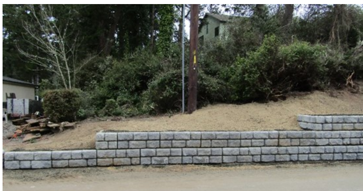
Finished retaining wall on the north side of Rhododendron Drive.

Some people have been wondering about the activity at 8th Street and Highway 101. The contractor Johnson Rock Products was recently awarded a small project to install an 8-inch water main across Highway 101 from the east side of the highway to the west side. This project is part of the City's larger Highway 101 – Maple to Quince waterline replacement project that is slated for construction in late fall 2017. The timeline for the waterline crossing of Highway 101 at 8th Street was accelerated to provide needed fire flows to the Options Counseling Center project