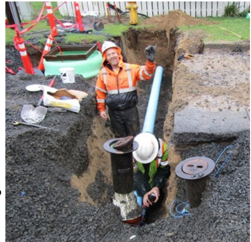
Carter & Company crew member installing the water main run to the fire hydrant location.

As the project continues, the contractor will complete the concrete demolition work for the ADA (Americans with Disabilities Act) improvements on Rhododendron Drive between Highway 101 and Greenwood Street and pour new concrete curb ramps and prepare the area between Hemlock and 9th streets for a new curb and gutter. They will also install two 6-foot bike lanes along Rhododendron Drive between 9th and Hemlock streets. Additionally, a new 5-foot sidewalk will be constructed along the north and east sides of Rhododendron Drive from 9th Street to Hemlock Street. Both Rhododendron Drive and Kingwood Street will have a new paved road surface once the project is completed. The project is on track to be completed by the end of March, weather permitting.