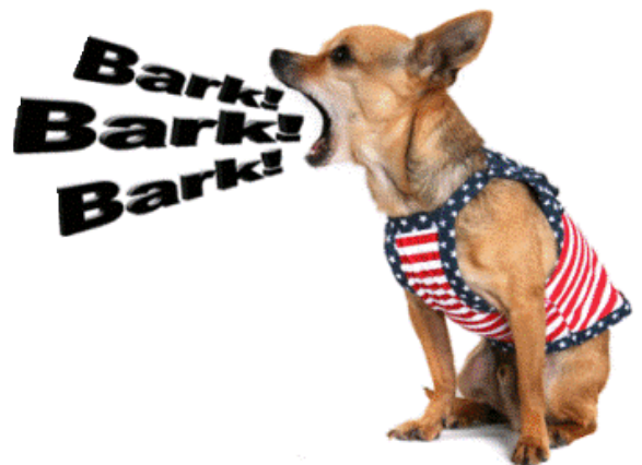
Barking dogs could be considered a nuisance under the City Code.

Contact: dan.frazier@ci.florence.or.us | 541-902-2180