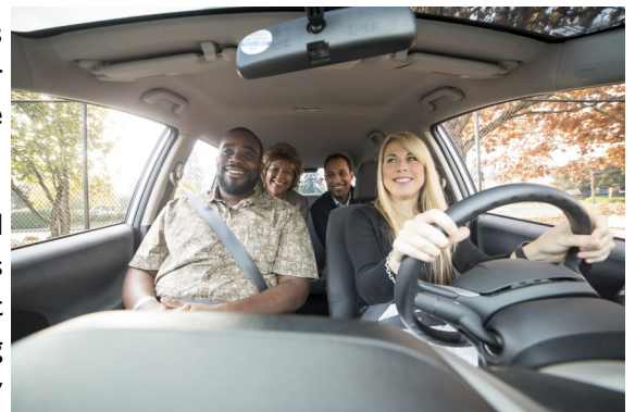
Join an existing carpool or set up your own carpool using Drive Less Connect’s online ride matching database.

Carpoolers regularly report that their stress levels have decreased since sharing the ride. One local carpooler says, “My co-workers and I are committed to carpooling to keep our carbon footprint low. We save on money and have so much fun commuting together. All of our partners, significant others, and children say that we come home very happy when we are commuting together.”