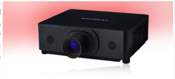
The FEC added new Hitachi LCD Projectors and high-resolution screens!

Two of the projectors have been mounted in the FEC’s flat floor meeting rooms, enabling uniform dual projection for large functions or individual projections for smaller meetings. The third projector has been installed in the FEC’s 450-seat theater and will accommodate a variety of applications by providing a maximum presentation impact for general sessions, meetings, and theatrical performances. Funding was provided in part by the Friends of the FEC. With the goal of maintaining “state-of-the-art” technology, the City of Florence and Friends of the FEC continue to invest in our wonderful facility.