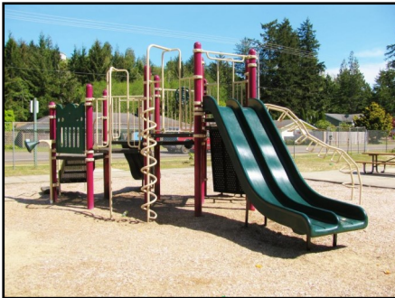
Above: The playground was updated in 2005 with new playground equipment.