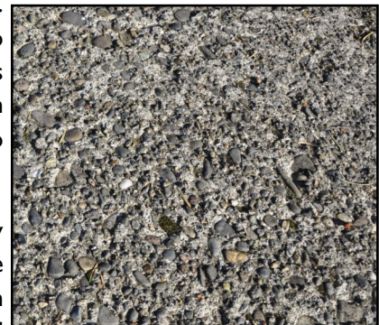
Eroded and uneven sidewalks create hazards and are dangerous.