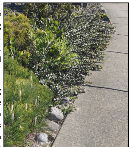
Well-kept sidewalks and boulevards create a safe transportation pathway and add to the City's curb appeal.

Information received regarding hazardous sidewalk conditions in the City right-of-way at a specific location is directed to the Public Works Department. A sidewalk inspection will be performed within 5 working days of a complaint, and the property owner(s) for the address(es) in which the hazard is located will be notified and given 60 days to repair the sidewalk. If the complaint is based upon someone having tripped and fallen, the property owner will be given 20 working days to begin the repairs. Be proud of your sidewalks—take care of them and enjoy them!