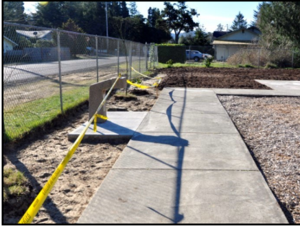
New concrete pad and ADA drinking fountain.