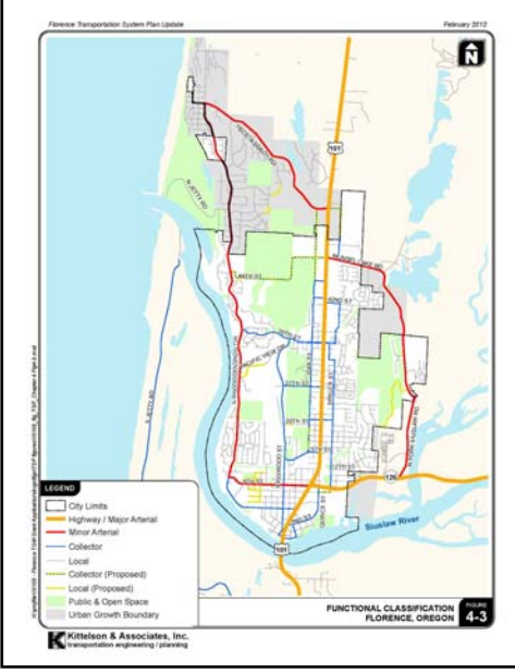
Florence's Proposed Street Classifications