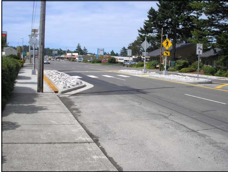
Pedestrian crossings were completed along Highway 101 last summer. They feature Rectangular Rapid Flashing Beacons, which are starting to be used throughout the state.

In response to concerns from our citizens, Public Works has installed new advance warning signage to alert motorists to pedestrians crossing Nopal/Bay Street. Since there is not a true intersection on Bay/Nopal (the driveway to the Port parking lot is not an