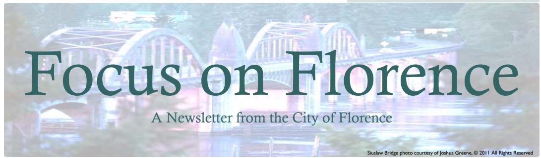
Susslaw Bridge