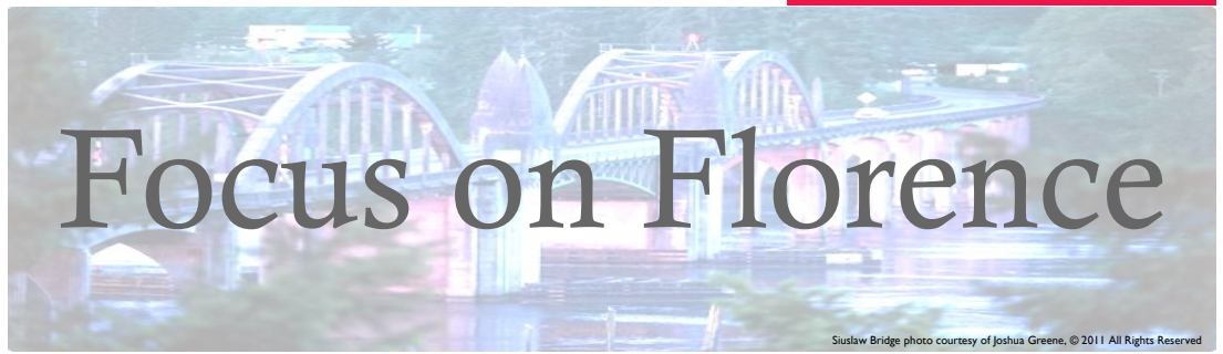
Siuslaw Bridge