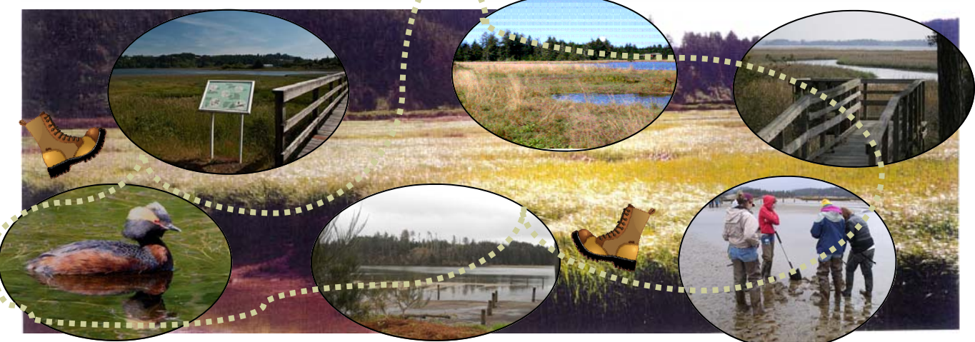
OPEN HOUSE from Page 1

The City, its partners, the Port of Siuslaw, and the Oregon Department of Transportation have been discussing the detailed location and design of the proposed estuary trail. Your ideas and comments on the trail location and design are welcome and needed!