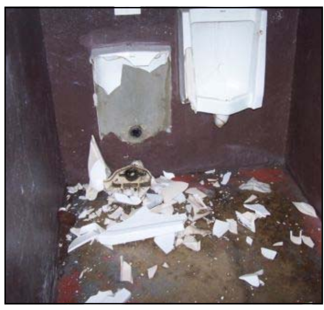
Damage to the Miller Park restrooms on March 19th will cost City taxpayers approximately $3,600 to repair and forced the City to close the facilities indefinitely.

Acts of vandalism is a community issue. Whether it is graffiti on a commercial building wall; graffiti on a fence or the destruction of public property it affects us all. Let's all work together on a community solution and take pride in our city surroundings. If you see it or someone vandalizing any property, call the Florence Police Department at 541-997-3515.