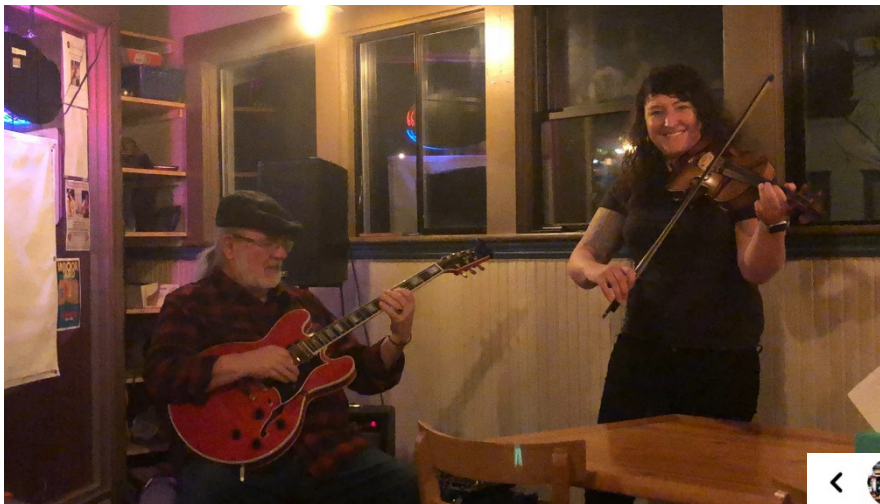
<Violin Bombing at HomeGrown Public House