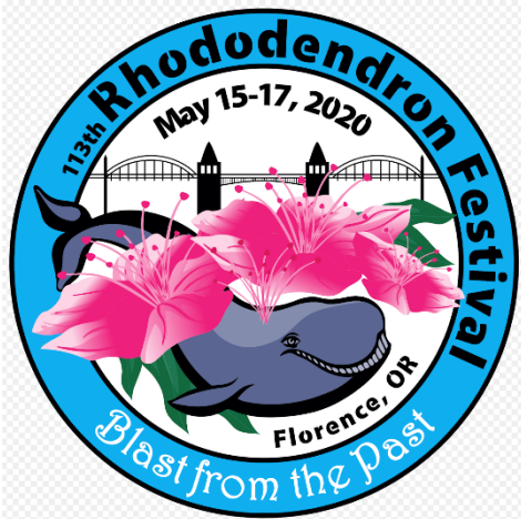
<2020 Rhododendron Logo