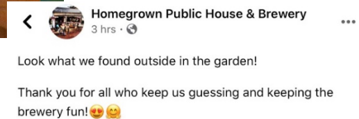
^Random Found Art HomeGrown Public House