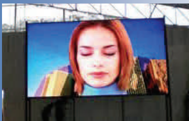
VIDEO IMAGING SIGNS