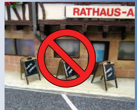
SIGNS CANNOT BLOCK SIDEWALKS

SANDWICH BOARDS & SMALL SIGNS , are Free Standing Signs, Six (6) square feet or under in size and Three (3) feet max in height. The City allows ONE small Sign per site, as long as the Sign is only displayed during Business Hours. Types of Signs typically used are: Sandwich Boards, Yard Signs or Metal Framed Signs.