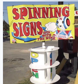
WIND AIDED SIGN