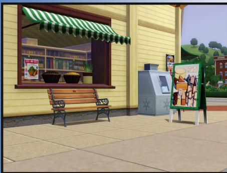
SIGNS MUST BE ON PRIVATE PROPERTY

SANDWICH BOARDS & SMALL SIGNS , are Free Standing Signs, Six (6) square feet or under in size and Three (3) feet max in height. The City allows ONE small Sign per site, as long as the Sign is only displayed during Business Hours. Types of Signs typically used are: Sandwich Boards, Yard Signs or Metal Framed Signs.